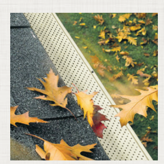
Rainware and Gutter Protection