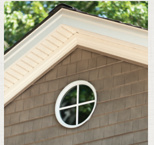
Vinyl Siding and Accent Panels

For a complete range of exterior products designed to work together, look no further than Ply Gem. As North America's leader in low-maintenance exteriors, no one offers more styles in more colors or provides more tools to help you create the look you want. From major design elements like siding and windows to architectural accents like trim and moulding, count on Ply Gem for superior quality and outstanding beauty.