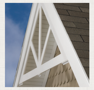
Trim and Mouldings