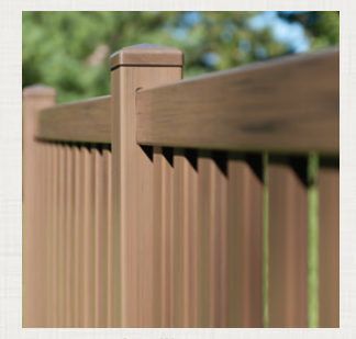
Fence and Railing