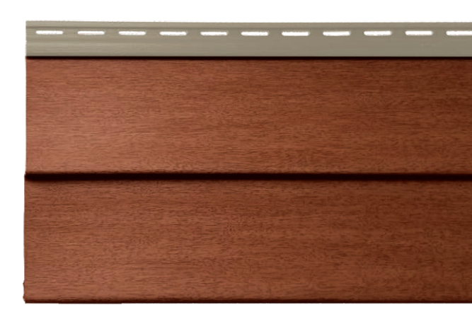
Subtle woodgrain texture shown in Burnt Sienna

*Product will not fade in excess of a Delta E of 1 Hunter unit outside the manufacturing tolerances in the first 5 years and a Delta E of 2 Hunter units outside the manufacturing tolerances after the first 5 years from the date of the original installation of the product on the property.