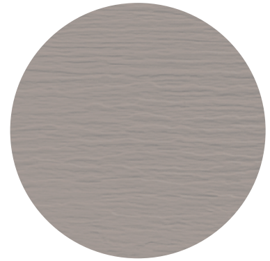
Subtle painted cedar texture shown in Brownstone